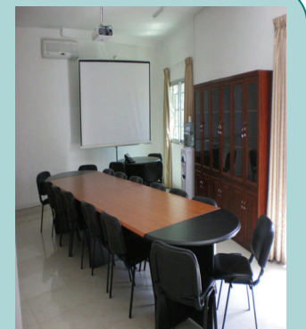
AGI meeting room

This took place at UNISA (University of South Africa) in Pretoria on 14-15 February 2005. Following the extremely positive and constructive discussion, which took place during this consultation, it was agreed that another consultation should be organised a few months later in order to develop the conceptual document and officially launch the AGI.