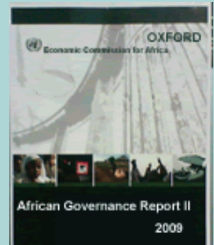
Report on Governance in Africa

The Africa Governance Institute has been designed as a centre of high-level policy dialogue advanced study and training on governance in Africa. As such, it is destined to engage in advocacy for democratic governance and development in Africa; to develop leading research and innovative training methods, in order to find solutions to urgent challenges of governance identified during policy dialogues We are opening up our newsletter to those of you who would like to send us an article on related topic on governance in Africa. You can send us your text in French or English, preferably by e-mail.