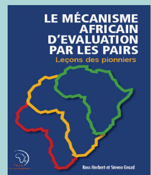
The African Peer Review Mechanism