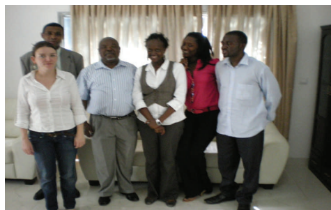
The African Governance Institute team