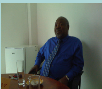
Pr. Georges Nzongola-Ntalaja

The team then produced a technical document in which it analysed the concept of governance as well as the problems which arise in Africa and suggested an approach to adopt and some solutions. The document defines the type of political and institutional reforms necessary, as well as capacities that should be created to strengthen governance. The report also places the Institute's vision, mission and functions as the foundations of an African strategy of democratic governance in the future.